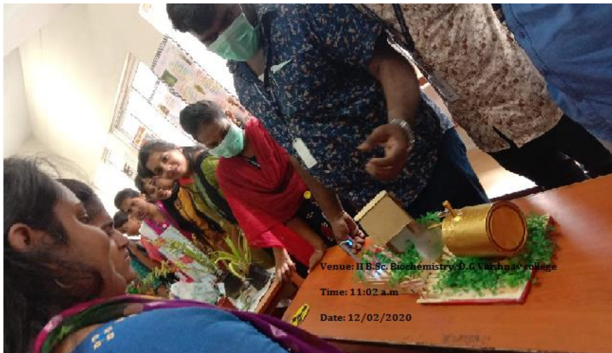
Venue: II B.Sc. Biochemistry, D.G Vaishnav college Time: 11:02 a.m Date: 12/02/2020