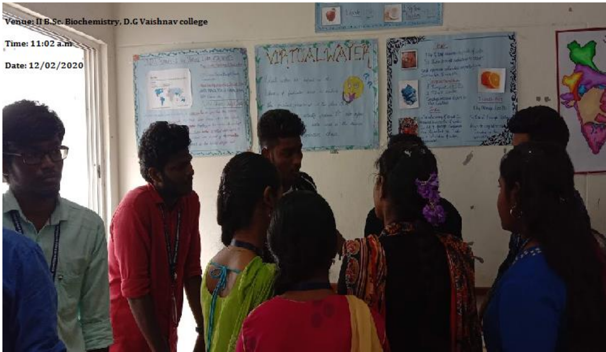
Venue: II B.Sc. Biochemistry, D.G Vaishnav college Time: 11:02 a.m Date: 12/02/2020